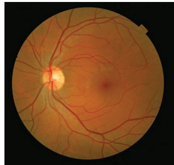
Retina with Diabetic Retinopathy: