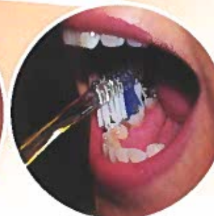
Don't forget to brush your tongue